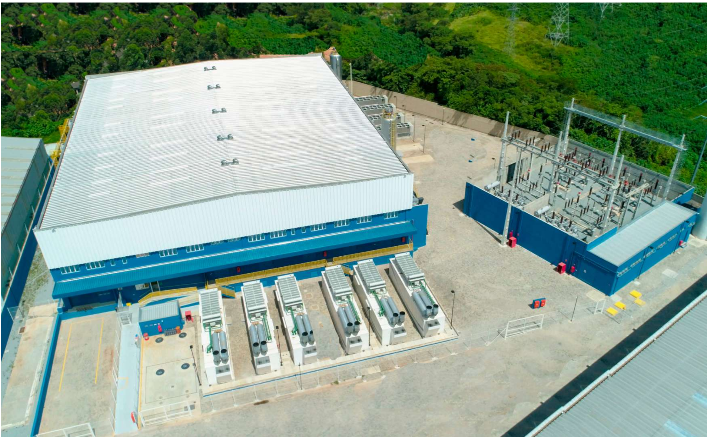
Data Center São Paulo 1